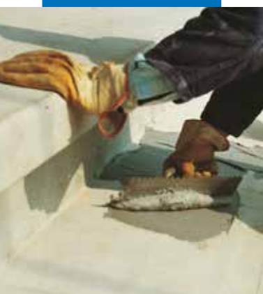
Application of Adesilex PG1 with a notched trowel for structural bonding of pre-fabricated steps