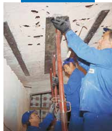
Placing metal sheet for structural reinforcement