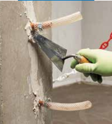
Fixing injection tubes and sealing cracks for structural consolidation