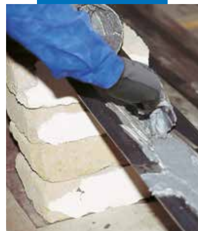
Application of Adesilex PG1 on metal sheet